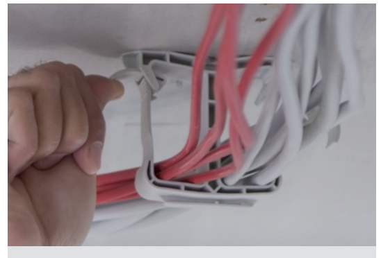
The SH holder forms a closed ring around the sheathed cables and can be re-opened using a handle.

Schnabl Stecktechnik GmbH Bahnhofplatz 1, 3100 St. Pölten, Austria Telephone +43 (0) 2742/221 67-0, Fax +43 (0) 2742/221 67-50 office@schnabl-steck.at, www.schnabl-steck.at