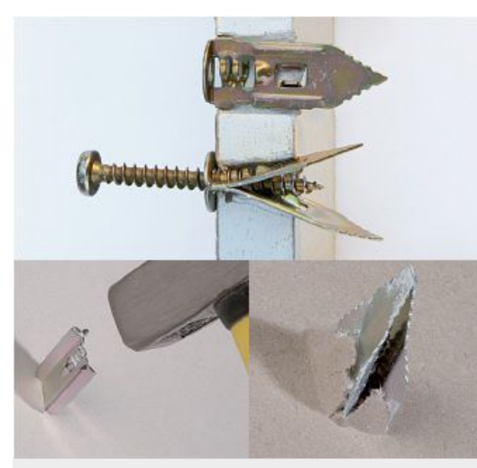
Using the PD Board anchor to attach the EC Euro clip easily on plasterboard and even on Heraklith.